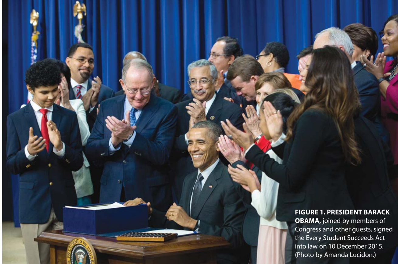
FIGURE 1. PRESIDENT BARACK OBAMA , joined by members of Congress and other guests, signed the Every Student Succeeds Act into law on 10 December 2015.

the free market to determine whether schools and school districts hire physics teachers with, say, bachelor's degrees in physics or academy graduates who may never have formally studied physics at all. And that was precisely the intent of the legislation's designers—to allow market forces, rather than content-area experts, to determine how teachers of physics and all other subjects are prepared.